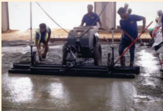
SOMERO COPPERHEAD XD-3.0