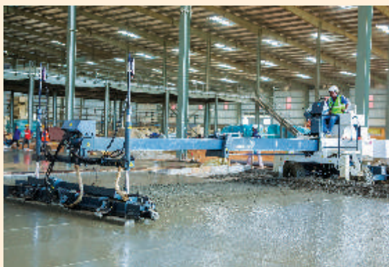
SOMERO BOOM LASER SCREED S-10A