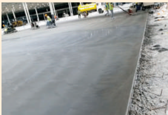
REDUCING JOINTS ADDING STRENGTH

MINITECH brings in latest technologies to make any kind of concrete floors for your industry or infrastructure.